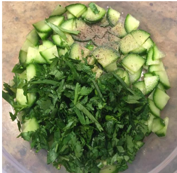
Cucumber raita with yogurt