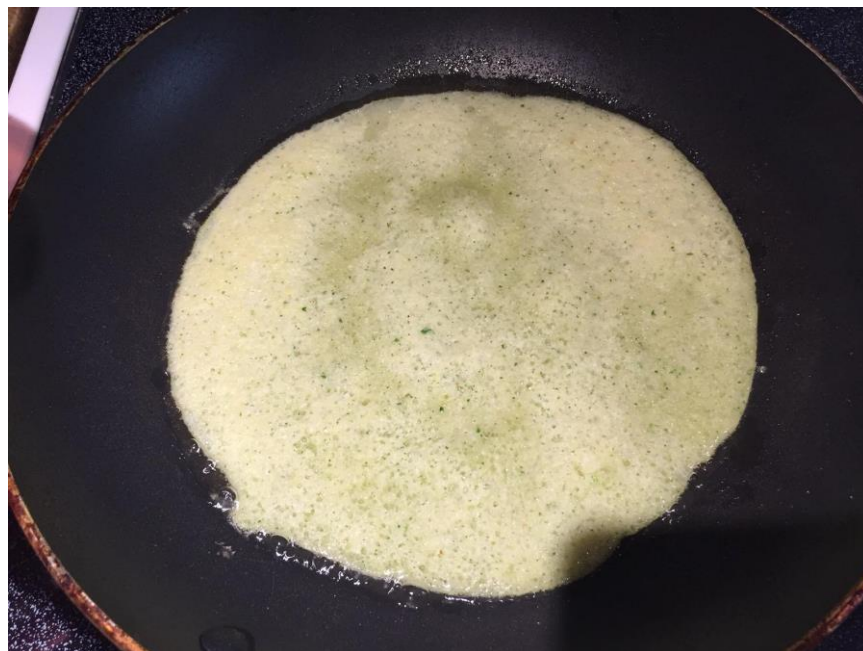
Moong dal dosa

Place a non-stick pan on the stove at medium heat. Take 1 teaspoon ghee or oil in a small plate and cut the top of a carrot or radish. Dip the cut portion in ghee or oil and smear it over the pan. Pour a ladleful of batter and spread it around quickly. Flip over. If you like ghee, you can drizzle it over the hot dosa.