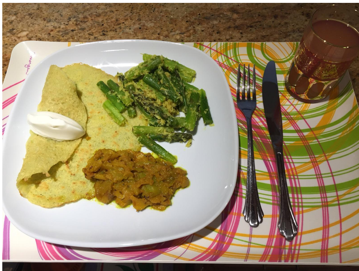
Day 1 Meal assembled by Masha

Masha made 2 dosas, served herself a small batch of asparagus, a tablespoon of apple thokku, and served a glass of apple juice. She added a dollop of cream cheese over the dosa. You can add a teaspoon of ghee or butter to warm dosa's, if you have them. Although Masha prefers to eat the dosa with a knife and fork, traditionally dosa is eaten by tearing it with the fingers of the right hand.